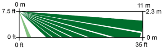
Side View Broad: 11 m x 11 m (35 ft x 35 ft)