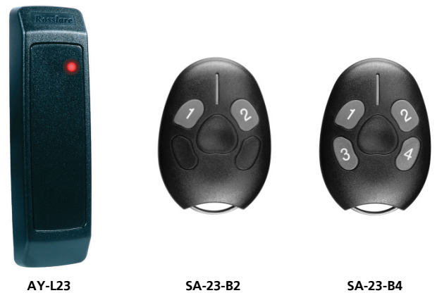
Figure 1: AY-L23 and SA-23-B2/B4